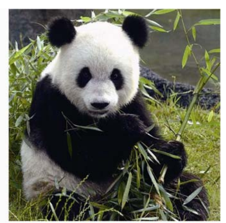
The Lovely Panda of Sichuan