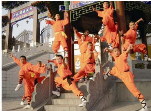
The Shao Lin Temple in Zhengzhou